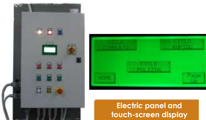
Electric panel and touch-screen display

> PER MAGGIORI INFORMAZIONI: FOR FURTHER INFORMATION CONTACT: POUR INFORMATIONS CONTACTER: