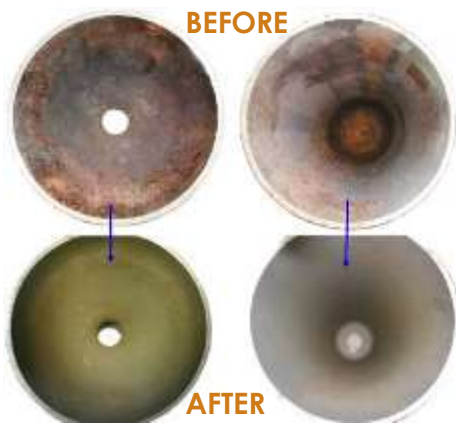
Cylinders before and after cleaning