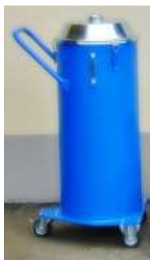
OPTIONS: POWDER RECOVERY TANK CONTAINER 110 lt average