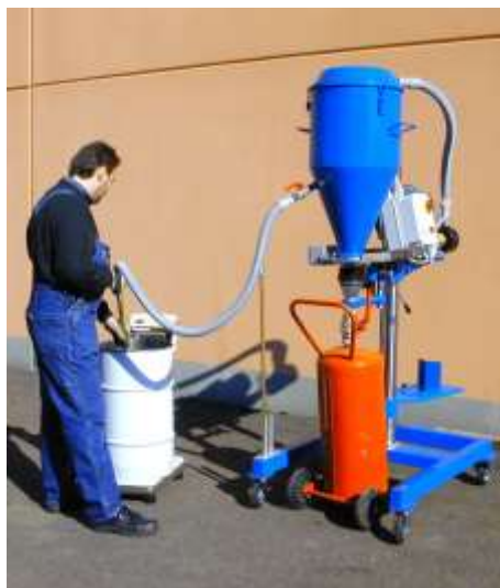
FILLING OF WHEELED FIRE EXTINGUISHER