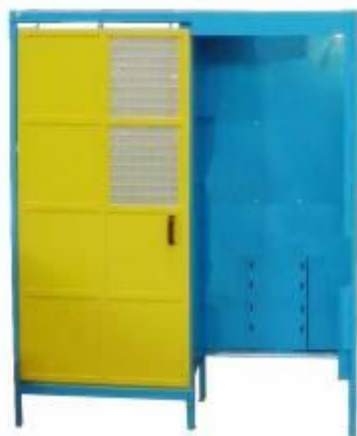
Heavy front protection

+ ELPA installed: 1950 x 800 x (h) 3700 mm